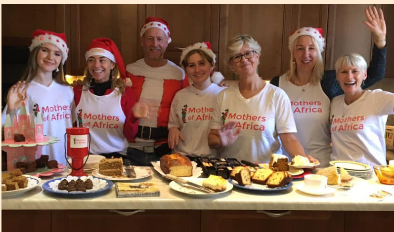
A photo of our team at our Christmas Market