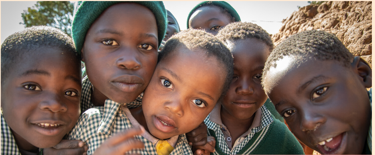
A photo from our visit to Chongwe, Zambia in July 2019

Once again huge thanks due to all our supporters, fundraisers and donors! It has been an interesting time since our last newsletter in February 2019.